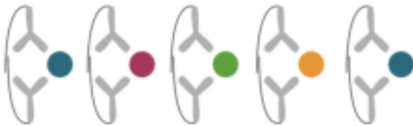
Figure 1: Because the PEA method detects a protein only when paired DNA oligos bind, cross reactivity is much lower than with traditional antibody-based assays ( https://olink.com/our-platform/our-pea-technology/ ).

Broad Clinical Labs (BCL) offers Olink® Explore HT, a highly multiplexed, high-throughput protein biomarker platform, to profile the relative concentration of proteins in liquid biopsy samples. The platform uses Proximity Extension Assay (PEA) technology, coupled with a Next Generation Sequencing (NGS) readout (Fig. 1).